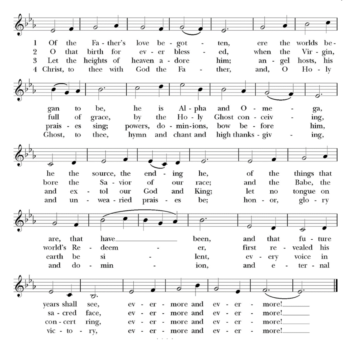
The People are invited to be seated.