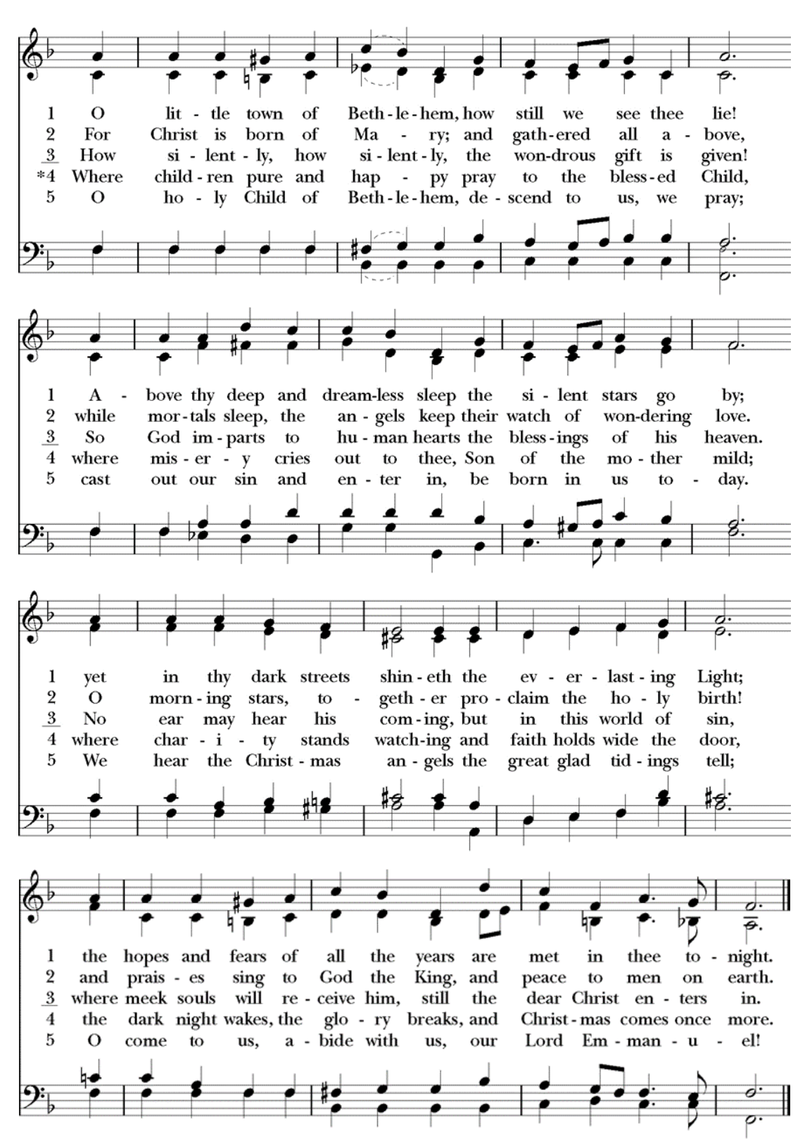
The People are invited to be seated.